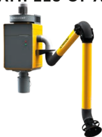
WallPro Single with Direct Mounted (DM) extraction arm