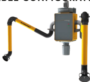
WallPro Double with Direct Mounted (DM) extraction arms