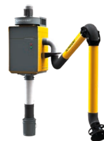
Option: Dustbin extension set

* Ask your sales representative for the complete list of configurations.