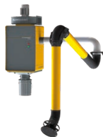
WallPro Single with External Mounted (EM) extraction arm